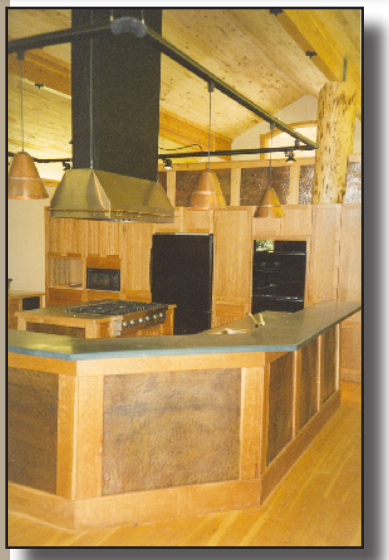
Kitchen & Great Room