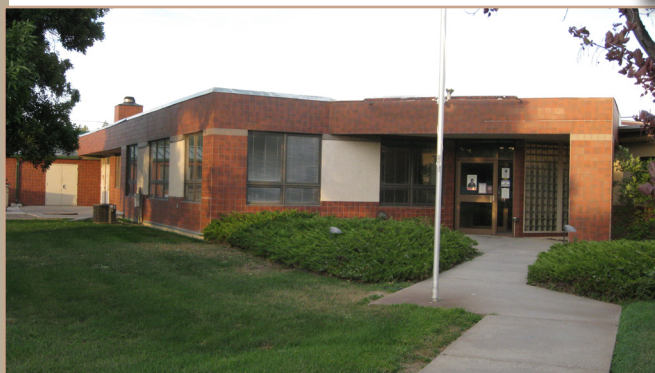
Nursing Home Entrance