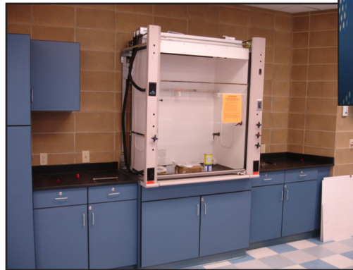
New Chemistry Lab