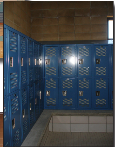
New Locker Rooms