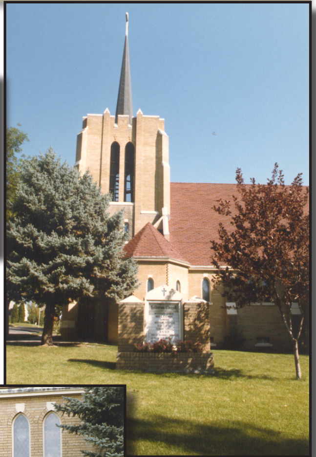
View From Grand Avenue

This project is an expansion and remodel of the existing church and school structures, which are located approximately 6 miles apart.