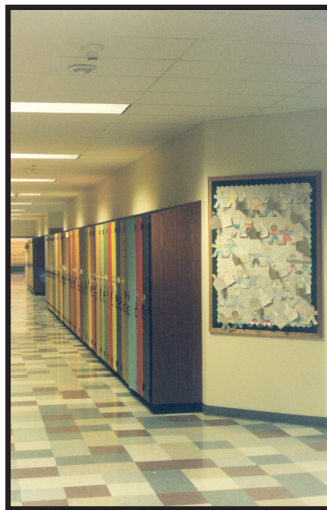
Colorful Lockers and Flooring

The space program called for adding six classrooms, a gymnasium, locker rooms, and administration areas to the existing building. The existing building has been remodeled to relocate the kitchen, library, and middle school classrooms. The program also calls for improving internal traffic flow so there is a minimum of cross traffic between the various grade levels by means of a looped corridor. Vehicle traffic is also revised to separate bus and car movements and minimize the risk of pedestrian conflicts with vehicle traffic.